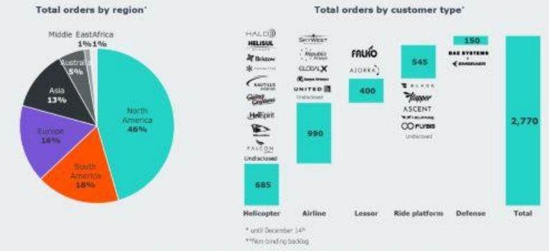
Largest and Most Diversified Backlog in the Industry

Lastly, Eve has received LOI's from clients in 12 different countries spread over five continents in the world. The Americas is home to close to two thirds of Eve's orders (North is 46% and South 18%), while Europe houses 16% of orders, and Asia 13%.